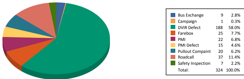
Work Orders by Type